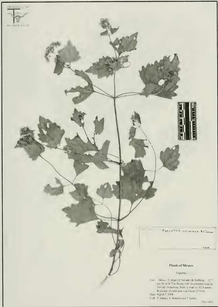
Fig. 1. Holotype of Ageratina colimana .